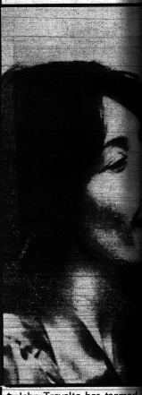
◆ John Travolta has teamed...