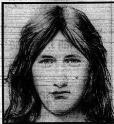
◆ Norman Asbitt's drawing of the killer

Star receive fees run into thousands of dollars.